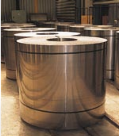
Cold rolled coil.